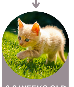
6-8 WEEKS OLD Very active and playful; around 1-2 pounds