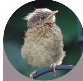
FLEDGLING Full feathers, hopping/fluttering