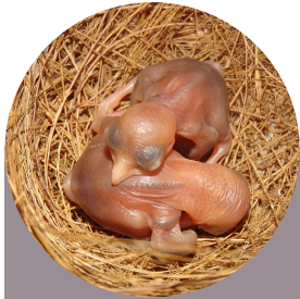
HATCHLING No feathers, eyes closed